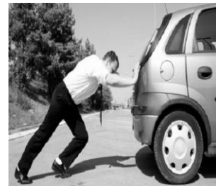
Newtons 2 nd Law of Motion [.jpg] (488×324)