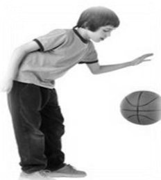
boy-dribbling-basketball-260nw-122906218.jpg (190×280)