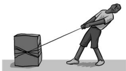
Man-dragging-a-stone [.jpg photo]. January 9, 2021.