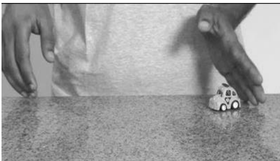
hqdefault.jpg (480×360)

People and things move because of force. Force is a pull or push that acts on an object due to its interaction with another object. To pull means to move something towards you while push means to move something away from you. Force that is applied on an object may cause a change in it – either in its movement or the direction in which it is moving.