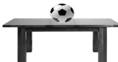
TableandBall.jpg (1000×377)