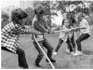
tugofwar.jpg (910×480)

5. What should the children do to win in the game Tag of War ?