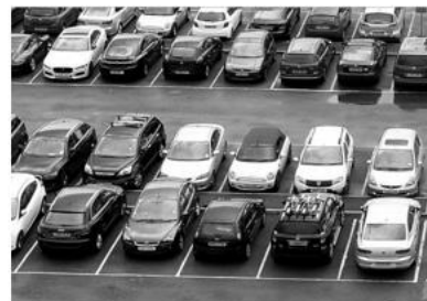
car-park.jpg (1200×900)