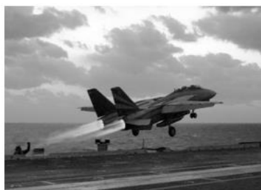
a8d90762adba3efecd5d6129fa74fd3a.jpg (1967×1311)

Mark check (✓) the boxes below each picture that show movements because of force.