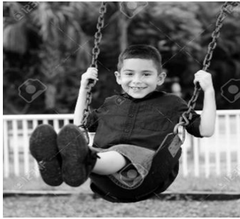
13979602-happy-young-boy-sitting-swinging-on-swing-at-outdoor-park.jpg (870×1300) https://previous.123rf.com

Direction. How can you move the objects on the pictures below? Write whether you'll Push It or Pull It .